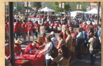
Autograph Signing with 110 Reality Stars and Fans