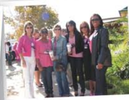
More Wild Women!