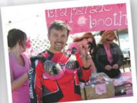
What a sport you are Fill! Motox for the Cure