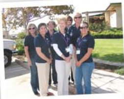
Hemet Hospice volunteers working at Wild Women