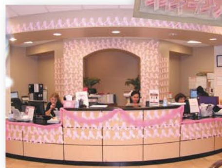
The Breast Center of Temecula Valley.