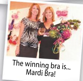
The winning bra is... Mardi Bra!

included more than 50 bras hand crafted by local women to encourage breast cancer awareness. More than 800 ladies attended the Wild Women of Wine Country luncheon and voted for their favorite bra. The 12 bras with the most votes are featured in the Traveling Bra Show calendar , now available for $10.00 each. All proceeds benefit Michelle's Place.