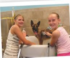
Dogtopia's Dog Wash