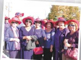
Red Hatters are ready to get wild!