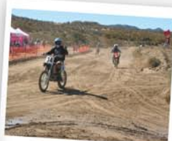
Motox for the Cure