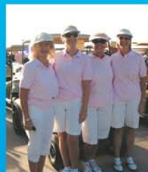
The Women's Club of Temecula Valley.